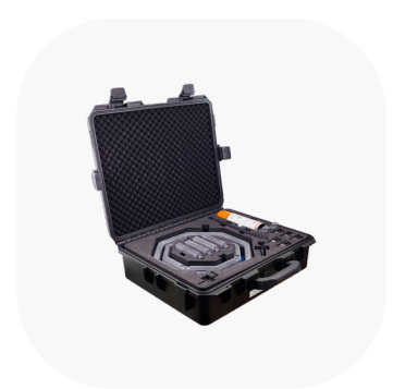
AESUBdots target frame - box