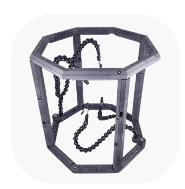
AESUBdots target frame

Markers are adhesive and are usually placed on the part before scanning. This time-consuming process can be reduced significantly by using our AESUBdots target frames.